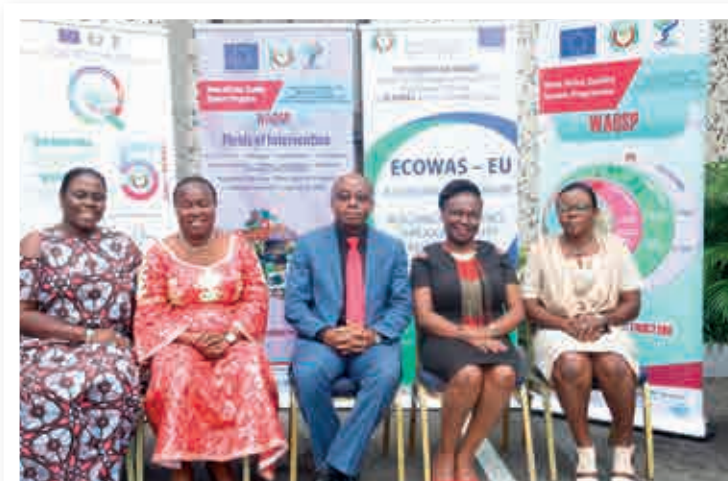
THE PRESIDENT OF ECOCONF (RED TIE, IN THE MIDDLE) SURROUNDED (FROM LEFT TO RIGHT) REPRESENTATIVES OF NIGERIA, SIERRA LEONE, CÔTE D'IVOIRE AND GHANA