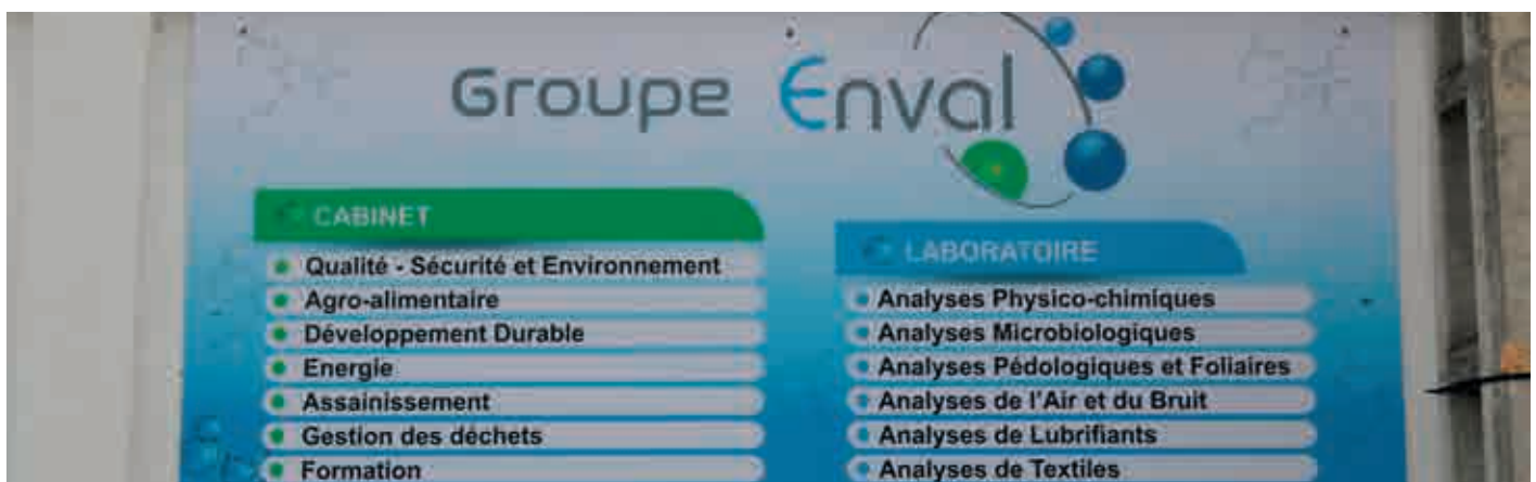
AREAS OF EXPERTISE OF ENVAL LABORATORIES

It should also be noted that these two workshops saw the participation of experts from the three (03) accreditation bodies that operate in the community area, namely the West African Accreditation System (SOAC) created by UEMOA, whose headquarter is in Abidjan, GhanaAS (Ghana) and NiNAS (Nigeria).■