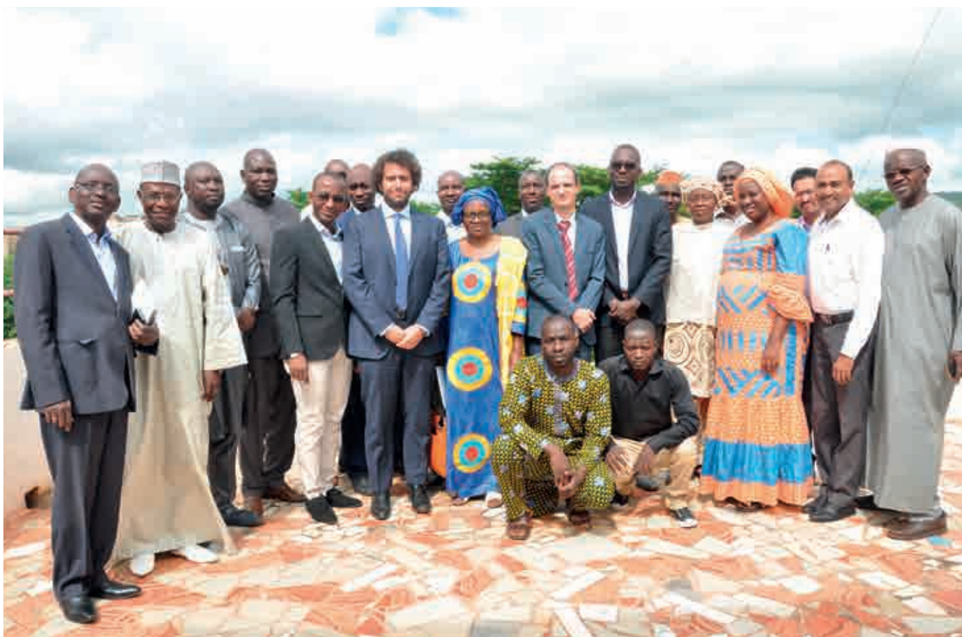
OFFICIAL OPENING OF THE TRAINING IN MAURITANIA BY MRS. KHADIJA M'BARECK FALL, MINISTER OF COMMERCE, INDUSTRY AND TOURISM, WITH ON HER RIGHT MR. MOHAMED ETHMANE, NATIONAL FOCAL POINT OF THE WAQSP

National training workshops: the WAQSP improves the skills of more than 700 resource persons to meet the requirements of the Quality Management System (QMS) and Environmental Management System (EMS) standards ▶