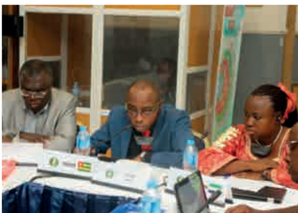
THE PRESIDENT OF ECOCONF DURING HIS INTERVENTION

In the following interview, the President of ECOCONF tells us more about it..