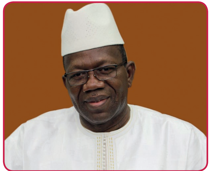
Mamadou Traoré Industry and Private Sector Promotion Commissioner