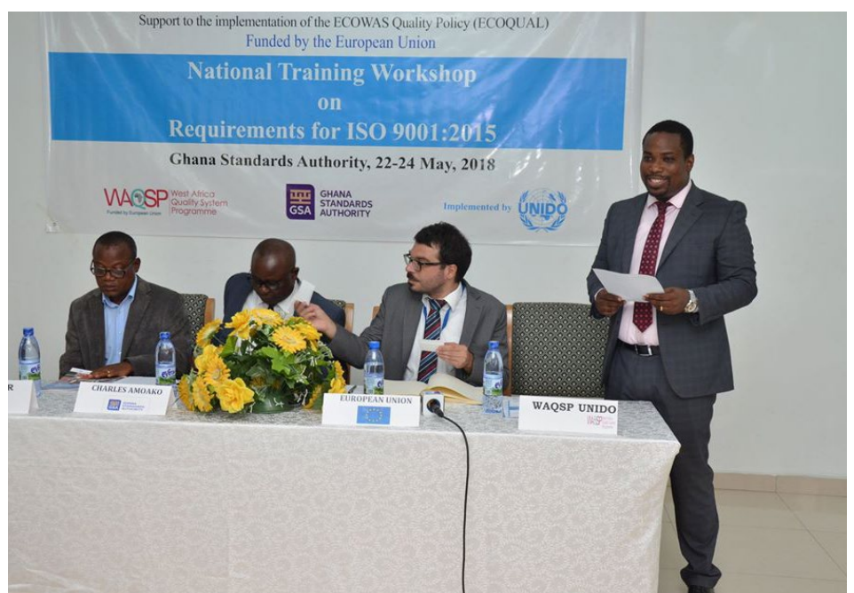
...AND THE AUTHORITIES' HIGH TABLE DURING THE WORKSHOP OF GHANA

In each country, approximately 25 participants benefited from the training. In order to ensure the sustainability and rationalisation of all these efforts, the selected participants were national auditors of the ECOWAS Quality Award (the benchmark for the Award being largely based on the ISO 9001 standard), members of the quality system of some national bodies in charge of the control of medicines (those benefitting from the support of the WAQSP to implement ISO 9001), together with other resource persons from various structures identified at national level. ■