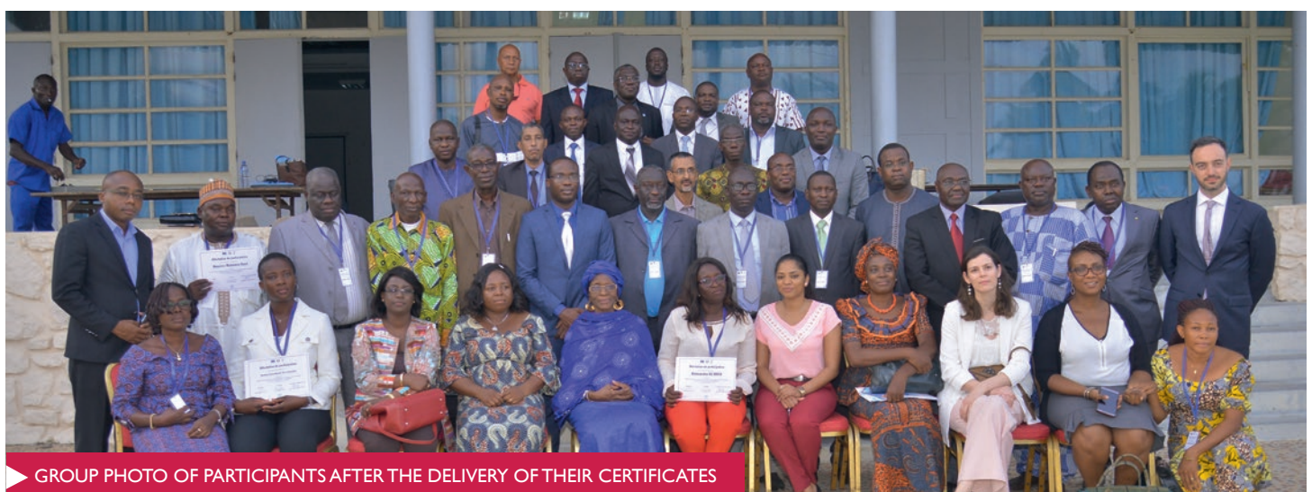
GROUP PHOTO OF PARTICIPANTS AFTER THE DELIVERY OF THEIR CERTIFICATES