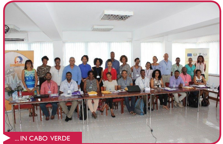
... IN CABO VERDE

If the previous Quality Programmes (phase I and phase 2), the ECOWAS-GIZ programme and other private or public initiatives have significantly helped to create a pool of skills in the region on the ISO/IEC 9001 standard, the needs for this type of expertise are still very important, particularly in support of the growing quality culture. It should also be noted that a new version of this standard was published in 2015.