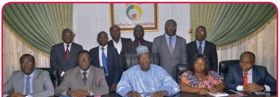
... POSING WITH QUALITY STAKEHOLDERS IN TOGO