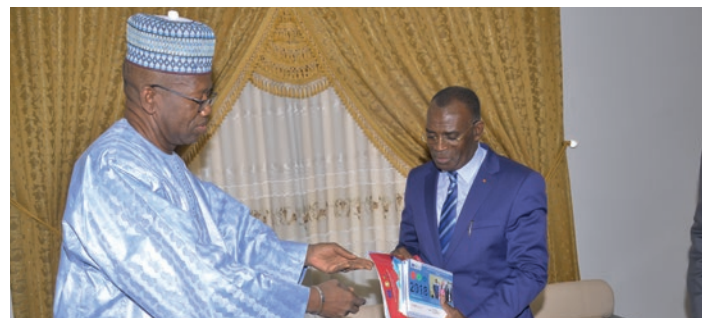
... GIVING THE WAQSP BROCHURES TO MINISTER GABRIEL IHOU