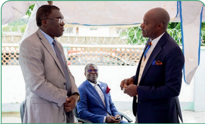
THE CTA/WAQSP DISTINGUISHED BY DG NINAS, FOR GIVEN SERVICES

World Metrology Day, which is celebrated on the 20th of May each year, was celebrated in Nigeria in Abuja on the 17th of May 2018. The event was organized as part of the activities of Nigeria's National Quality Infrastructure Programme (NQIP).