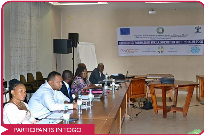
PARTICIPANTS IN TOGO